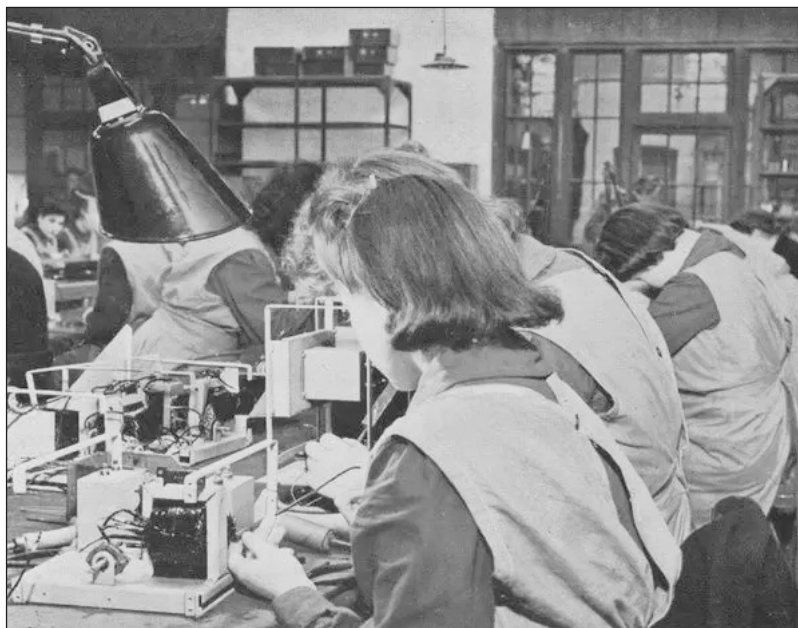
[Young offenders in a borstal for girls in the 1940s]